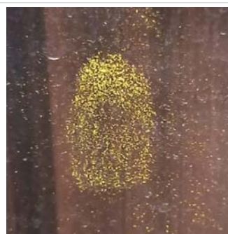
Figure 3: Development of Latent Fingerprint with the help of turmeric powder on the non-porous wood surface.