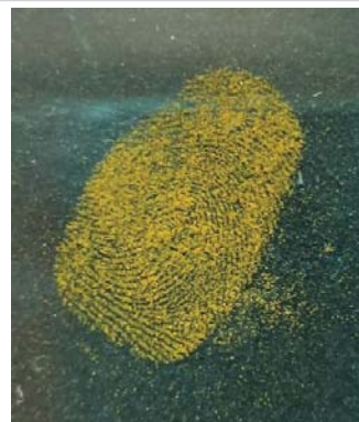
Figure 2: Development of Latent Fingerprint with the help of turmeric powder on a non-porous plastic sheet.