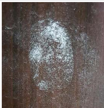
Figure 4: Development of Latent Fingerprint with the help of talcum powder on the non-porous wood surface.