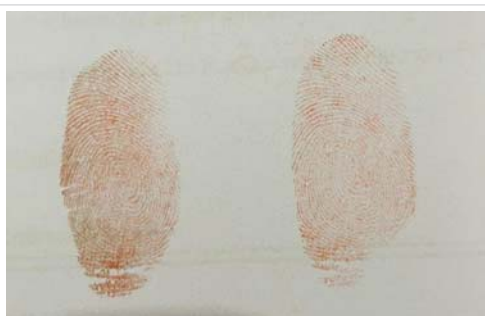
Figure 7: Development of Latent Fingerprint with the help of vermilion powder on the porous white paper surface.