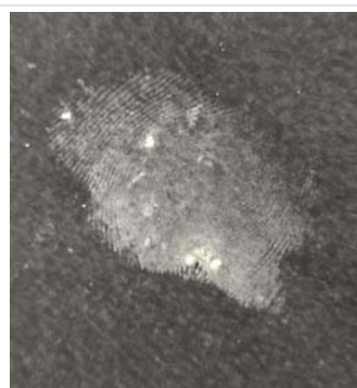
Figure 11: Development of Latent Fingerprint with the help of Fuller's earth powder on the porous black paper surface.