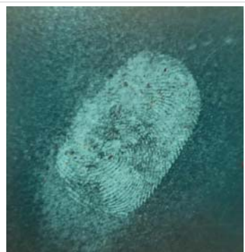
Figure 5: Development of Latent Fingerprint with the help of talcum powder on the non-porous metal surface.