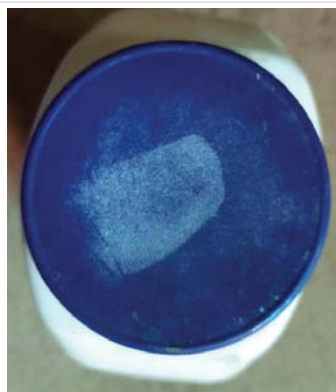
Figure 6: Development of Latent Fingerprint with the help of talcum powder on the non-porous plastic surface.