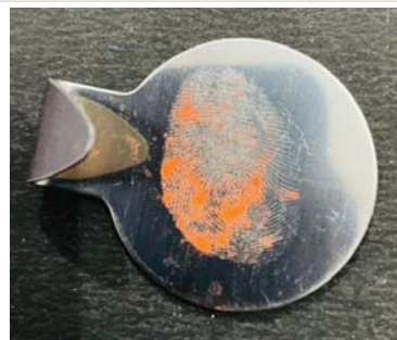
Figure 8: Development of Latent Fingerprint with the help of vermilion powder on the non-porous steel surface.