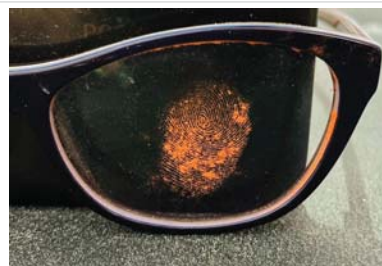
Figure 9: Development of Latent Fingerprint with the help of vermilion powder on a non-porous white surface.