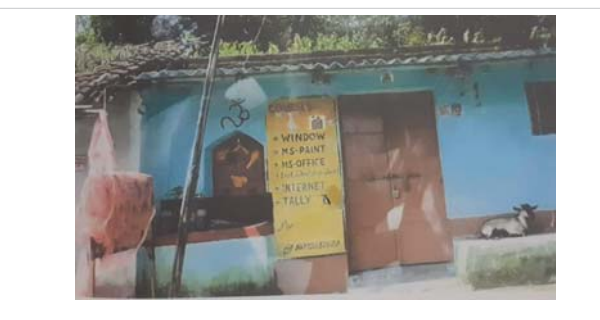
Figure 1: An Image of a cybercafe in a village in Jamtara District of Jharkhand.

The advancement of technology has made people much more dependent on the internet and gadgets for all their needs. The Internet has given people easy access to everyone to everything while sitting in one place. The speed of digitalization in our country is so fast and the government of India also promotes digitalization with the digital India scheme and e-governance scheme, with digitalization the threat related to digitalization evolved (Figure 1).